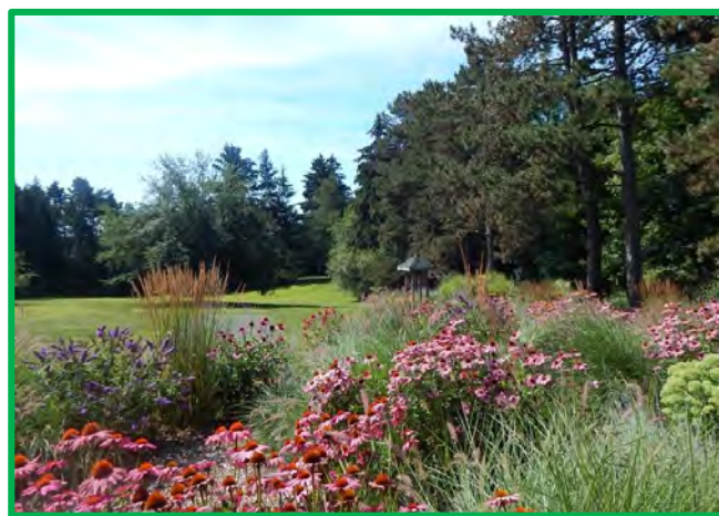
Grounds at St. Francis Retreat Center, DeWitt, Michigan