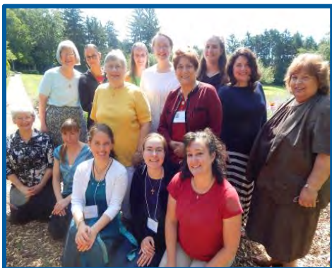
Information Conference Participants

I am a flower of Sharon, a lily of the valleys. Like a lily among thorns, so is my friend among women. Like an apple tree among the trees of the woods, so is my lover among men. In his shadow I delight to sit, and his fruit is sweet to my taste.