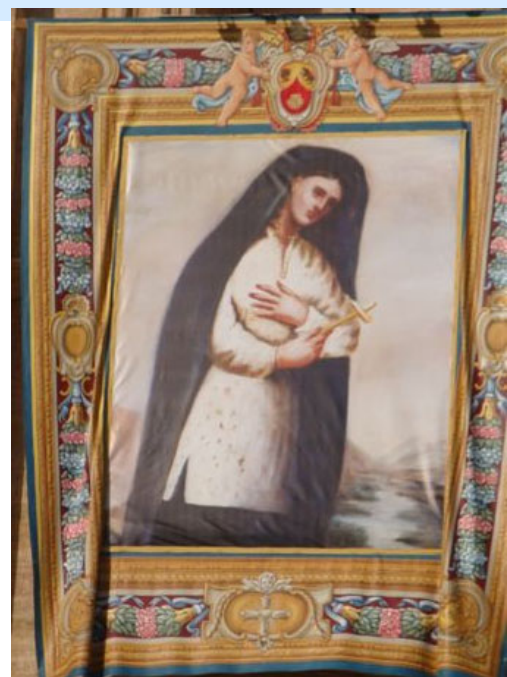
Image from the day of Canonization of Saint Kateri Tekakwitha