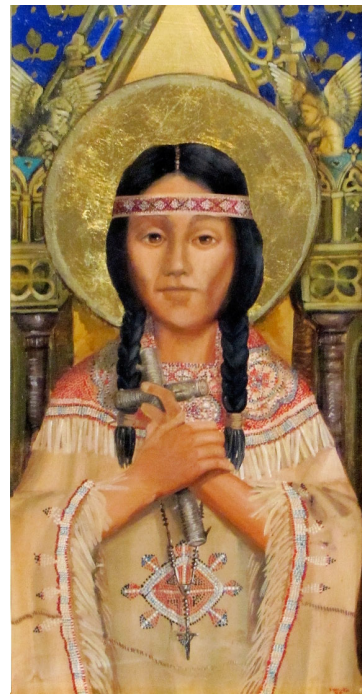
Saint Kateri Tekakwitha, pray for us!

Anniversary Reflections continued from page 10 of Colorado Springs, Colorado on October 30, 2011. Today at age 67, I am looking back on the happiest year of my life. I had read information concerning the effectiveness of this splendid, ancient sacramental; this past year I experienced it myself.