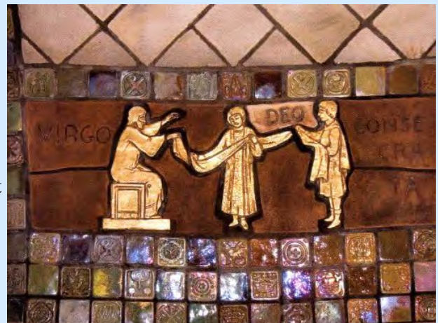
" Virgo Deo Consecrate " - Basilica of the National Shrine of the Immaculate Conception.